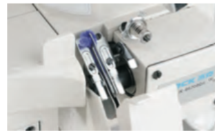
Out-moved thread cam