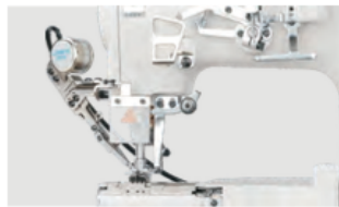
Auto thread trimming