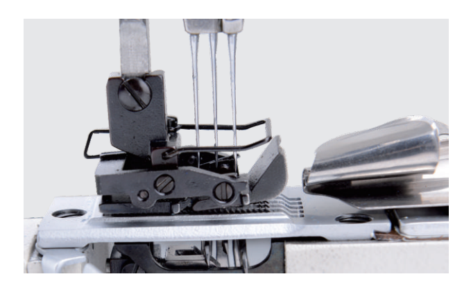
5 Removable needle guard, beautiful stitch.

Realization of the rear puller lubricated makes the rear puller lubricate continuously, which extends the life of rear puller a lot