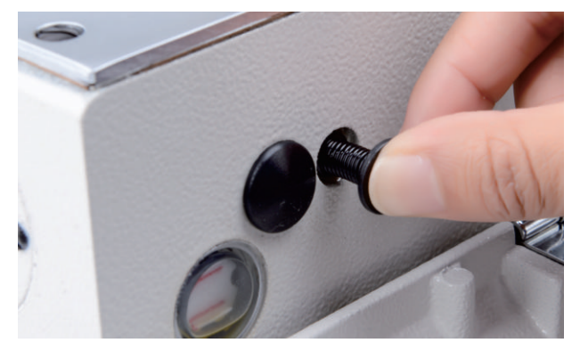
6 Stich length adjust button. Widely used with different fabric.

The needle position is always in upside. Convenient to sewing, needle exchanging and thread making.