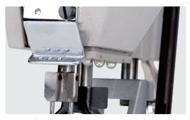
7 LED light

The button can adjust the stitch length easily to satisfy many different requirements.